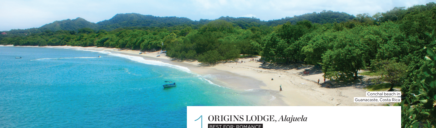
Conchal beach in Guanacaste, Costa Rica